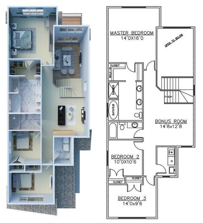
Upper Floor - 1147 sq.ft.

DATA IS DEEMED RELIABLE BUT IS NOT GUARANTEED ACCURATE BY THE REALTORS® ASSOCIATION OF EDMONTON. COPYRIGHT 2025 BY THE REALTORS® ASSOCIATION OF EDMONTON. ALL RIGHTS RESERVED. Trademarks are owned or controlled by the Canadian Real Estate Association (CREA) and identify real estate professionals who are members of CREA (REALTOR®, REALTORS®) and/or the quality of services they provide (MLS®, Multiple Listing Service®)