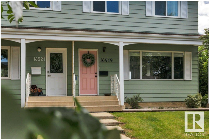
16519 115 St NW, Edmonton, AB

Main Floor Exterior Area 558.03 sq ft Interior Area 522.03 sq ft