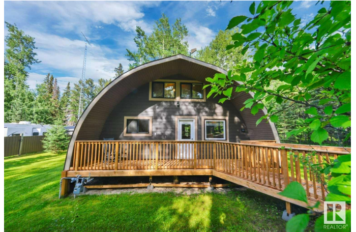
77 Township Rd 462A, Wetaskiwin County, AB