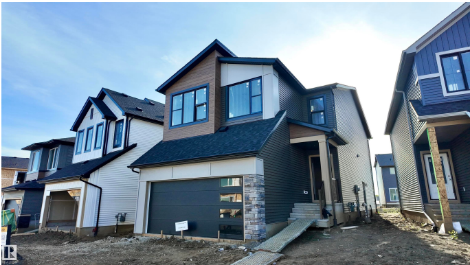
MAIN FLOOR 965 SQ. FT.

Located in the highly sought-after community of Edgemont in West Edmonton, this beautifully designed 2-storey home offers 4 spacious bedrooms, a main floor den, upper floor laundry, and a generous bonus room. The open-concept main floor features elevated ceilings and a chef-inspired kitchen with quartz countertops throughout and a massive walk-in pantry. All appliances are included! Enjoy the convenience of a side entrance, ideal for a future basement suite, and the comfort of higher 9' ceilings on both the main and basement levels. West-facing backyard provides evening sun and will be fully landscaped in summer 2026. Walking distance to playgrounds, a strip mall, daycare, and scenic ravine trails—this home perfectly combines lifestyle and location. A must-see for families looking for space, style, and future potential! *Some photos are of another similar home and are not representational of exact finishing*